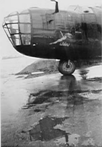
B24-D 42-40776 "Widow" at Harrington - 1944