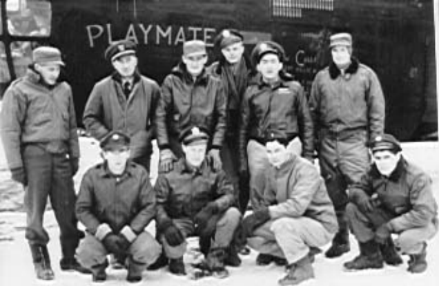
B24D 42-63980 at Harrington - Winter 1944 "Playmate" and crew have just returned from a trip to the CBI. Crew members not named in this picture.